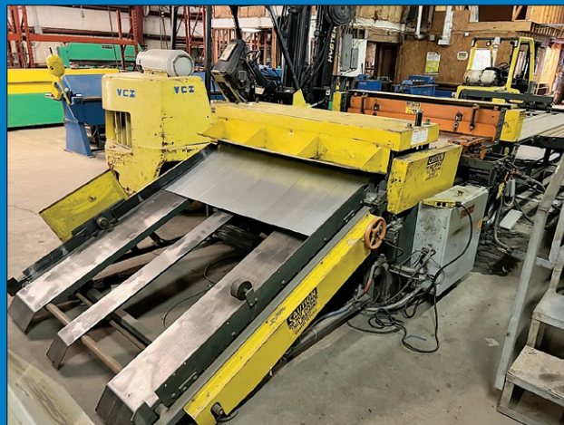
60" Engel Square Duct Fabricating Line w/ TDF Machine

CINCINNATI INDUSTRIAL AUCTIONEERS auctioneers | appraisers | since 1961 | cia-auction.com | info@cia-auction.com 2020 Dunlap St., Cincinnati, Ohio 45214 Phone 513-241-9701 Fax 513-241-6760